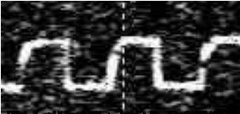
QRSS image showing a series of pulses. QRSS is a form of digital communication using Morse code where the tone of each dot and dash is used to convey information. The image shows a series of pulses that appear to be the letters 'W', 'R', 'D', 'W', 'R', 'D'. See was lots of QRSS.

Saturday, 20 June 2009 17:16 - Last Updated Tuesday, 23 June 2009 18:40